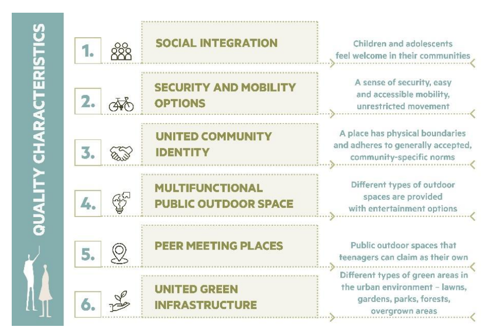
Fig. 4. Features of a public outdoor space suitable for teenagers [created by authors]

The desire of teenagers to develop different kinds of relationships and interactions with other people should be considered in the design of new public spaces. Teenagers are keen to stay in places that are well frequented, but the recreational spaces they create give a sense of semi-public outdoor space, as well as in places that are not closely supervised by parents. The qualitative characteristics of children and adolescents in public outdoor spaces are similar but not identical (see Figure 4) [28].