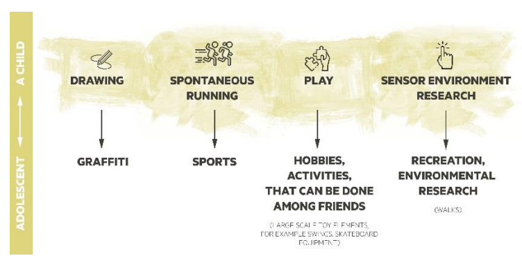
Fig. 2. Transformation of interests in the "child - adolescent" transition