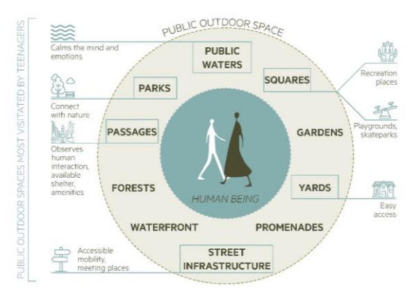
Fig. 1. The most visited types of public outdoor space by teenagers [created by authors]