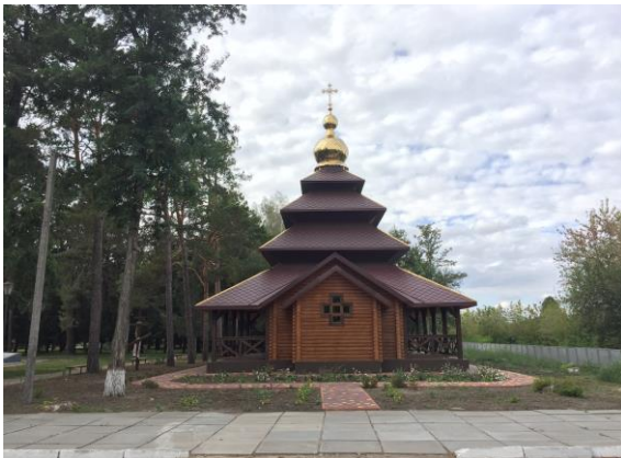
Fig. 7. Natural environment of the church in the village of Oleksandrivka

is why such considerable attention is paid to the peculiarities of location and choice of construction site).