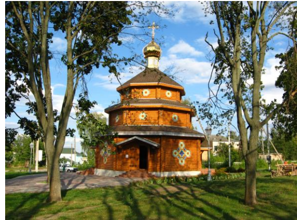
Fig. 4. The Church of St. Demetrius of Thessaloniki in the ethno-complex "Ukrainian village"

Part of the ethno-complex is occupied directly by the ethnographic museum with houses, outbuildings and workshops, there are thematic tours "Architecture and life of rural housing in Ukraine in the late nineteenth century", master classes in folk crafts, mini-shows on pottery and blacksmithing, and also a mini zoo. Wooden mud-passages, a characteristic element of the Ukrainian estate, add authenticity. There are also greenhouses with tropical plants.