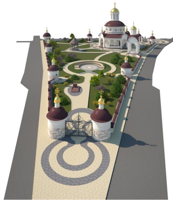
Fig. 5. Landscape design of the Saint Nicolas Temple Complex in Deimanivka village [project of LICENCEARCH]

With certain reminiscences of individual elements of facades in Orthodox churches and temple complexes Scientific and Design Bureau "LICENCEARCH" (author of the project – O.S. Sleptsov) there is no direct copying of historical samples inspired by the architect, but modified national Ukrainian styles are used and attention is paid to design. The specificity of design solutions is that they are a bold experiment with the form of the plan, which, on the one hand, remains in line with Orthodox canons, and on the other is innovative, modern, non-archaic. The following list of modern temples plan types is used: rotunda in various variants (main), as a rule – on a stylobate with a possibility of a circular bypass (columnless, perimeter, with a colonnade on perimeter, with