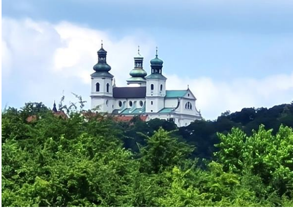
Fig. 3. The Camaldolese monastery complex in Cracow's Bielany [photo by M.Krupa, 2021]

1605–1609. To this day, monks have been living in small houses – hermitages or in single monastic cells.