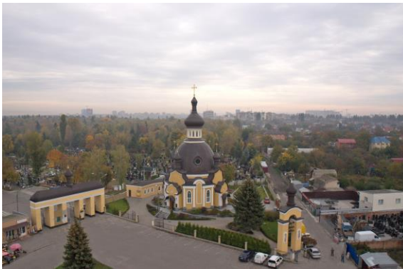
Fig. 9. Landscaping around the church of Sts. Apostles Peter and Paul at the Berkovetskyi Cemetery in Kyiv.

silhouette gives the impression of even greater merging with pines around (Fig. 7).