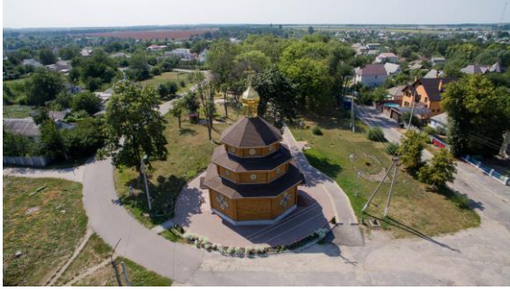
Fig. 6. Church of All Saints of the Ukrainian Land in Myronivka in the structure of the city park [photo LICENCEARCH, 2019]