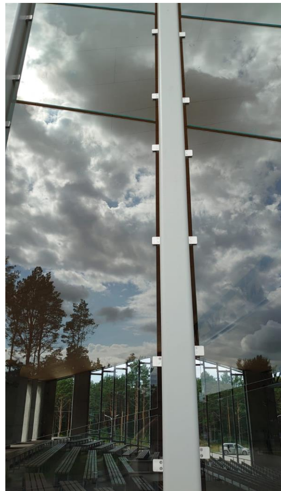
Fig. 11. Roja open-air stage / summer concert hall in landscape (View line B)

In line with the existing and prospective mobility habits of the users of this environment, key viewpoints to the concert hall (A; B; C; D; E) have been selected, which are further analysed in the study (Figure 1).