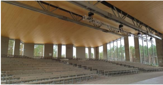
Fig.8. Roja open-air stage / summer concert hall in landscape (View line E)