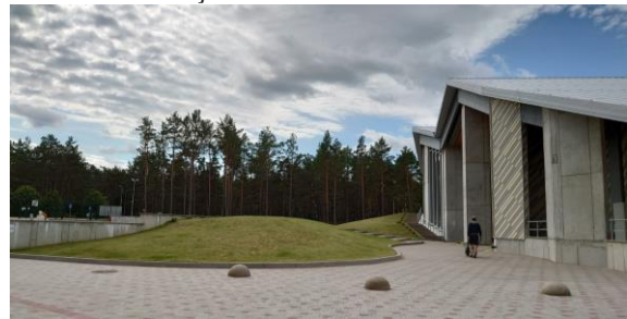
Fig. 5. Roja open-air stage / summer concert hall in landscape (View line C)