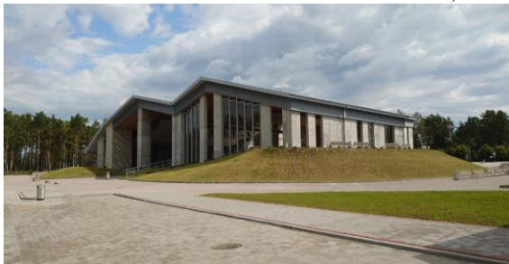
Fig. 2. Roja open-air stage / summer concert hall in landscape, viewed from Jūras Street (View line A)