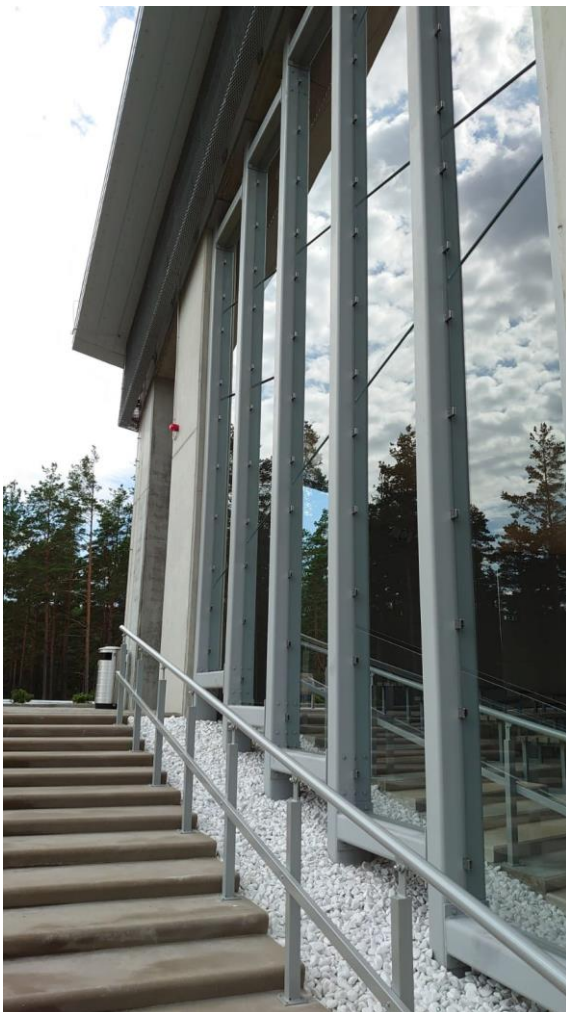
Fig. 10. Roja open-air stage / summer concert hall in landscape (View line B)