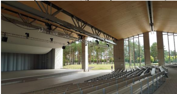
Fig.9. Roja open-air stage / summer concert hall in landscape (View line F)