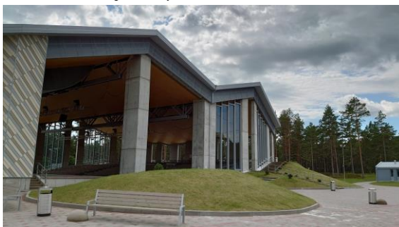
Fig.4. Roja open-air stage / summer concert hall in landscape (View line D) [photo by the author, 2020].