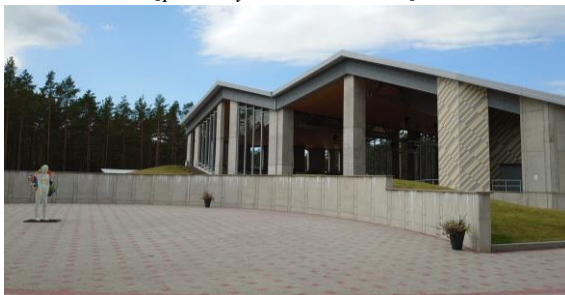
Fig. 3. Roja open-air stage / summer concert hall in landscape (View line C)