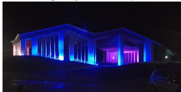
Fig.6. Roja open-air stage / summer concert hall in landscape (View line B)