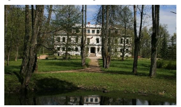
Fig. 13. The Gentlemen's House from the park side