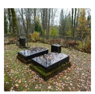
Fig. 9. The graves of the Count's descendants and relatives preserved in a special compartment in the Nitaure cemetery. During the Soviet period, they were periodically and cruelly vandalised, but now the remaining monuments have been cleaned up