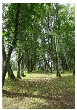
Fig. 19. Alley in the park