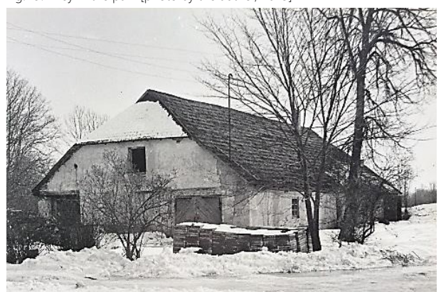
Fig. 20. The lost barn near the manor house