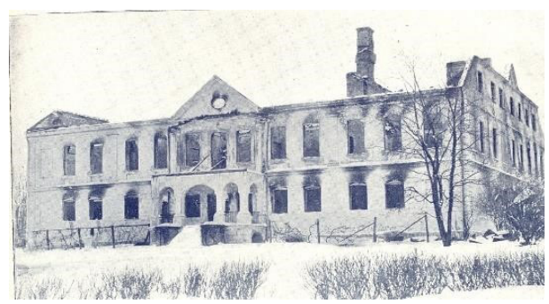
Fig. 12. The Lord's House after its burning in 1905. Livlands Zerstörte Schlösser