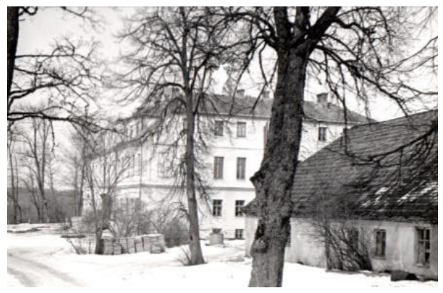
Fig. 21. The Lord's house and barn [photo by the author, 1978]