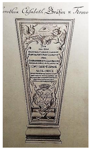
Fig. 6. The tomb monument of Countess Dorothea Elisabeth von Fermor in the Lutheran Church in Nitaure. Drawing by J. K. Brotze, 1796