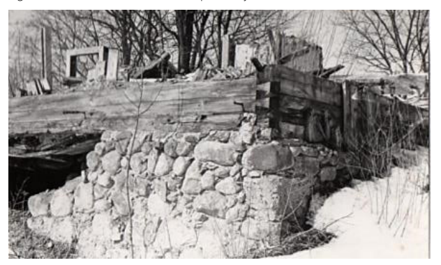
Fig. 22. Ruins of the gardener's house (?)