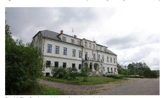
Fig. 14. The Gentlemen's House from the park side