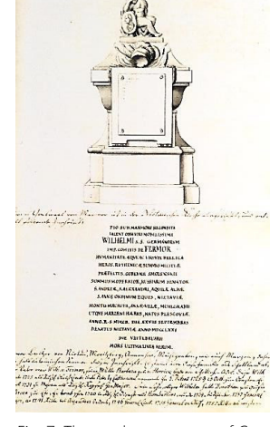
Fig. 7. The tomb monument of Count Wilhelm Georg von Fermor in the Lutheran Church in Nītaure. Drawing by J. K. Brotze, 1796