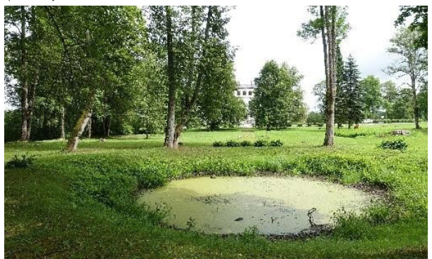
Fig. 16. Parks