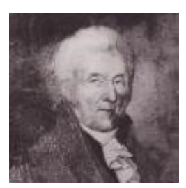
Fig. 2. Jakob Pontus Magnus von Stenbock [internet resources]