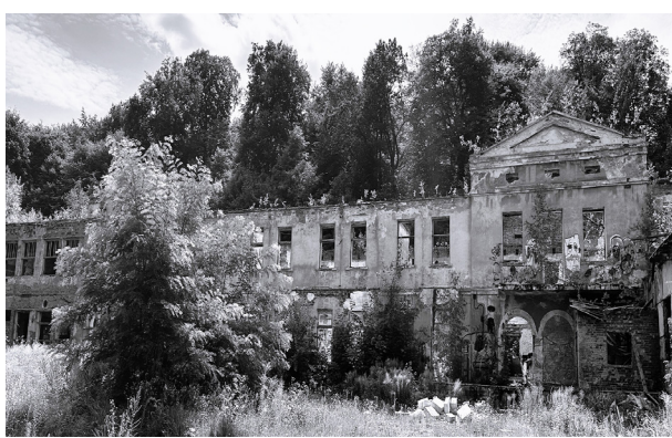
Fig. 2. The existing state of the main historical building, 2023

bath, which was very popular among the townspeople. In the first half of the 20th century, a stadium and a tennis court appeared here, and then a ski jump [12]. The Pohulyanka has strengthened its importance as a popular place for active recreation and sports among the townspeople.