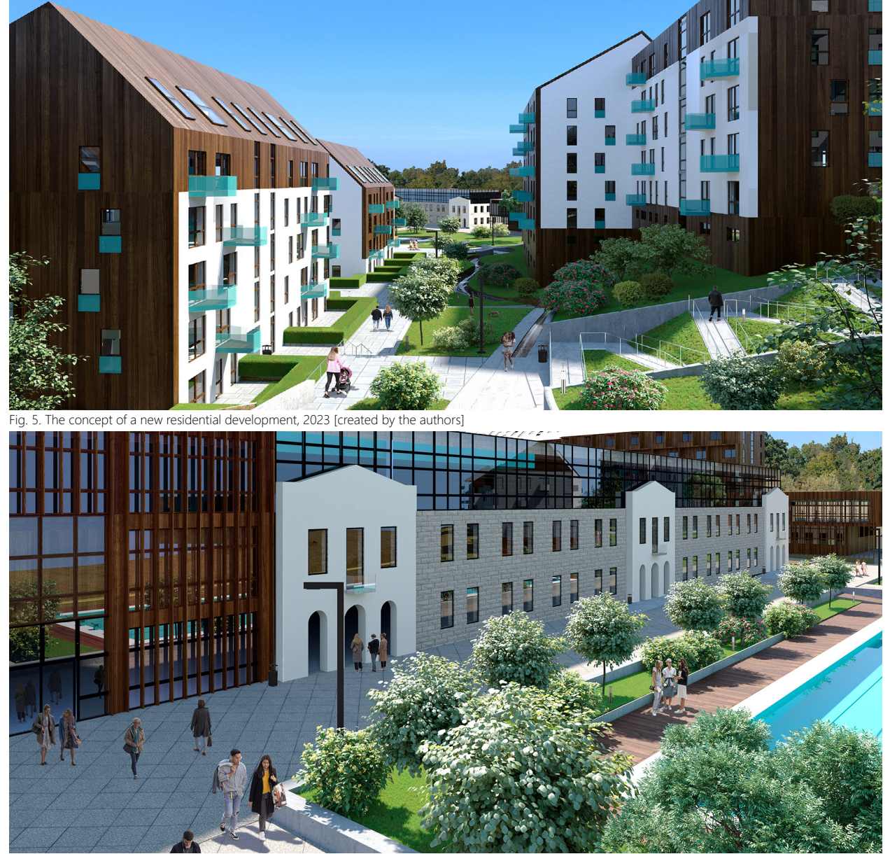
Fig. 6. The revitalization concept of the former winery into the sports and recreation complex, 2023 [created by the authors]